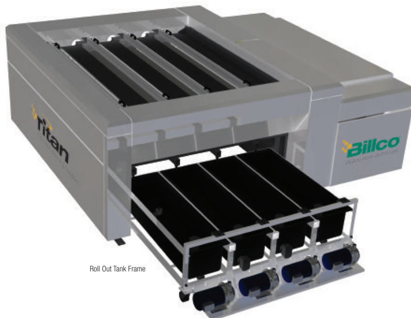
Roll Out Tank Frame

Product shown without all required safety features. Content subject to change. *Available on separate conveyor.