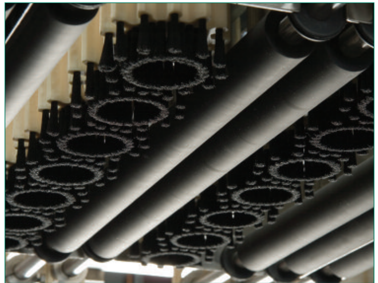
Top Surface Oscillating Scrubber Section: Internal View