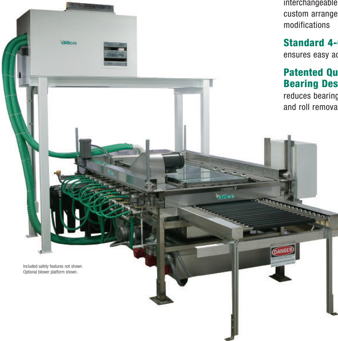
Included safety features not shown. Optional blower platform shown.

Patented Quick-Release Bearing Design — reduces bearing replacement and roll removal time